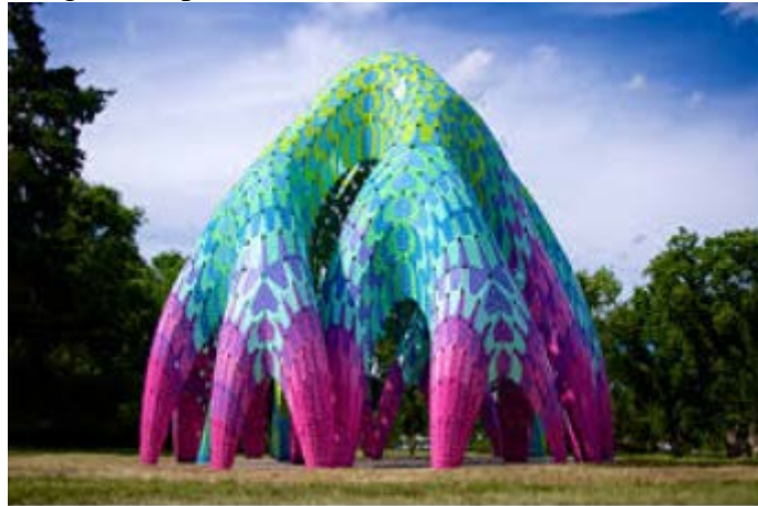
Fig.3 The Application of Color Art in Landscape Design

atmosphere for people by displaying the three-dimensional structure and color changes. Through the scientific design and effective use of color elements, the landscape can be displayed more hierarchically, which is more in line with people's viewing needs. We take the design of garden plants as an example [7]. On the basis of ensuring space coordination, we can choose plants of different types and colors. Through the scientific and reasonable collocation of different seasonal flowers and trees, we can realize the collision of various colors, thus in the garden viewing. Make people have a better look and feel experience. In addition, with the help of reasonable color matching, the individual characteristics of the garden can be fully demonstrated, and the garden's taste can be improved while reducing the pressure on the garden space [7].