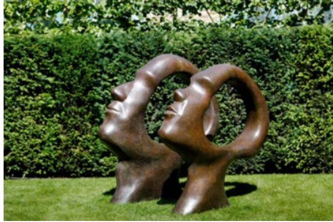
Fig.1 Application of Surface Art in Landscape Design